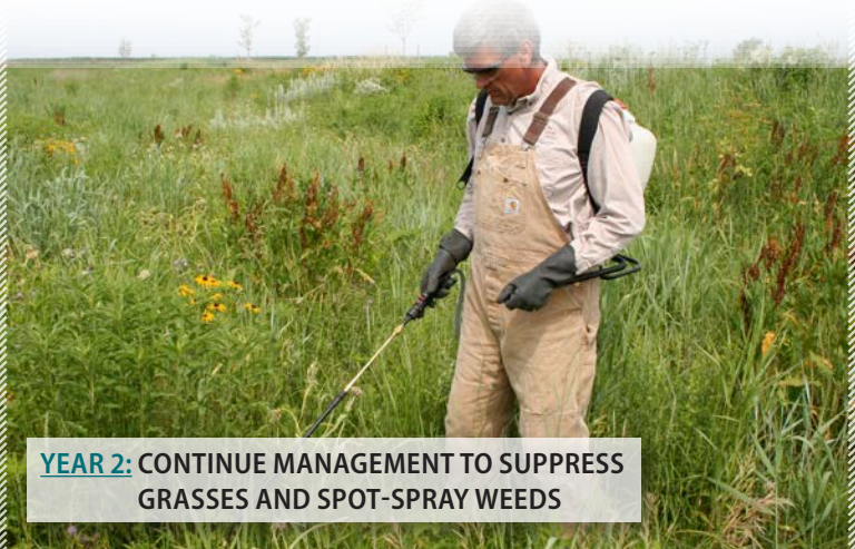
YEAR 2: CONTINUE MANAGEMENT TO SUPPRESS GRASSES AND SPOT-SPRAY WEEDS