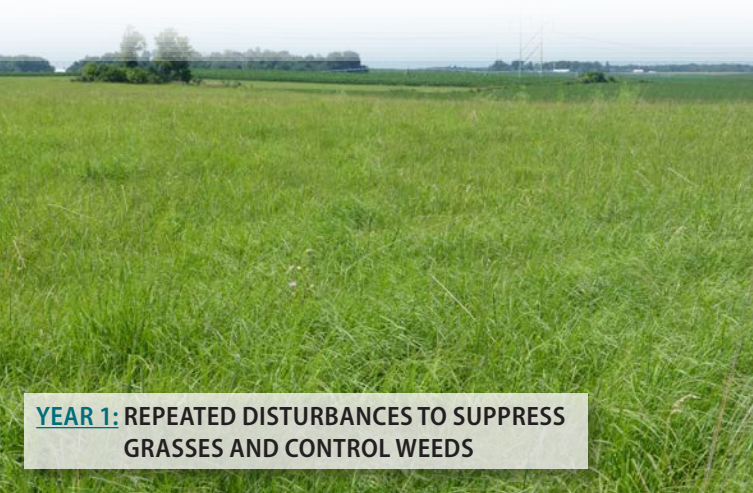
YEAR 1: REPEATED DISTURBANCES TO SUPPRESS GRASSES AND CONTROL WEEDS