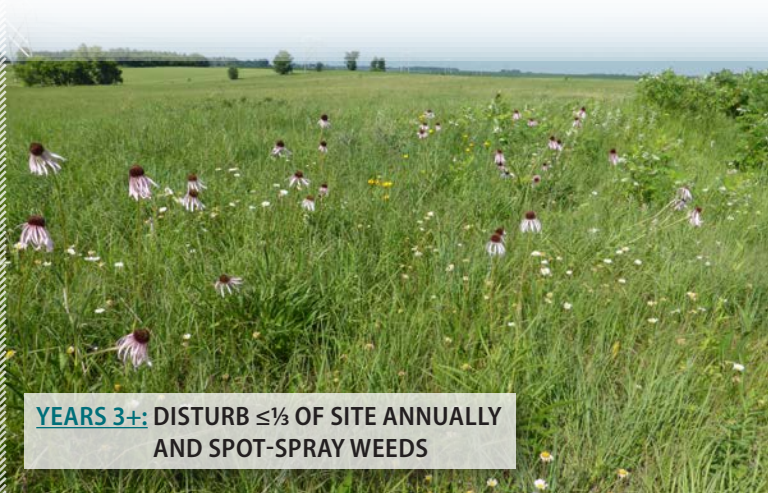
YEARS 3+: DISTURB ≤ 1/3 OF SITE ANNUALLY AND SPOT-SPRAY WEEDS