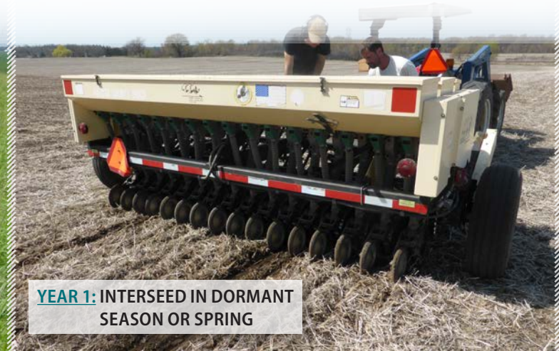
YEAR 1: INTERSEED IN DORMANT SEASON OR SPRING