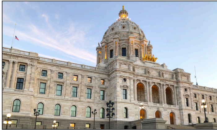
BWSR's general fund budget for fiscal years 2024 and 2025 supports ongoing grant programs, agency operations, easement stewardship and Wetland Conservation Act implementation.

by the Legislative-Citizens Commission on Minnesota Resources (LCCMR). BWSR is listed as a collaborator with three programs: Statewide Forest Carbon Inventory and Change Mapping, Conservation Cooperative for Working Lands, and Increasing Diversity in Environmental Careers. Language updates to a 2022 BWSR appropriation to reflect efforts for the Watershed and Forest Restoration: What a Match! project were also included.