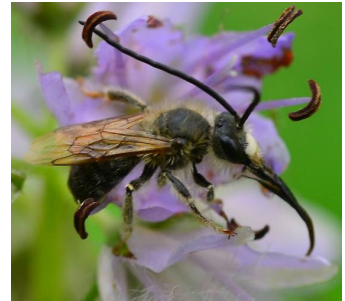
Andrena bee on waterleaf

At least two specialist pollinators use Virginia waterleaf, the waterleaf cuckoo bee ( Nomanda hydrophylli ) and Andrena bees ( Andrena geranii ). Flower nectar and pollen attract many other types of bees including bumblebees, long-horned bees ( Synhalonia spp. ), mason bees ( Osmia spp. ), Halictid bees ( Lasioglossum spp. , Augochlorella spp. , etc.), Andrenid bees ( Andrena spp. ), and bee flies (Bombyliidae). The foliage is occasionally browsed by White-tailed deer, but does not seem to be a preferred food. The species can be used to establish cover on bare areas, such as woodland openings after buckthorn removal. It may not be ideal for some small woodland gardens due to its ability to spread.