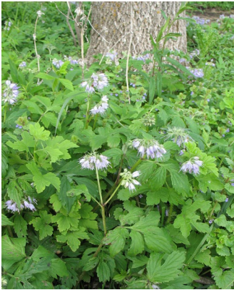
Virginia Waterleaf growing in rich woods

With attractive flowers and unique leaf patterns, Virginia Waterleaf is a stunning component of the woodland understory. This early blooming species grows 12-20" tall in partial to dense shade in moist woods and floodplain forests. Its elegant flowers provide important early season sources of pollen and nectar for pollinators. The plant's ability to tolerate disturbance, establish quickly and thrive along within a diversity of other woodland flowers makes it well suited for restoring woodland understory cover.