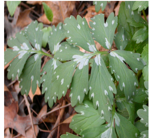
Leaf with light spots.

Pale violet, pinkish or white flowers are born in loose clusters from May to June. The tubular flowers are about ½ inch long, and have long stamens. Leaves are deeply divided into 3, 5 or 7 lobes with coarse teeth. Mature leaves are six inches long and four inches wide and may be slightly hairy. The leaves commonly have a water stained appearance that can fade with age. The main stem is purplish where the leaves attach and may have flattened hairs on the stem. Hydrophyllum was formerly placed in the Hydrophyllaceae (Waterleaf) family but is now considered part of the Boraginaceae (Borage) family.