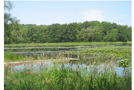
Vegetation providing water quality and wildlife habitat benefits