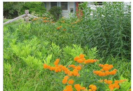
Biofiltration area designed to infiltrate and filter stormwater