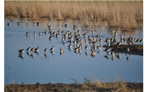
Shorebirds using a restored wetland