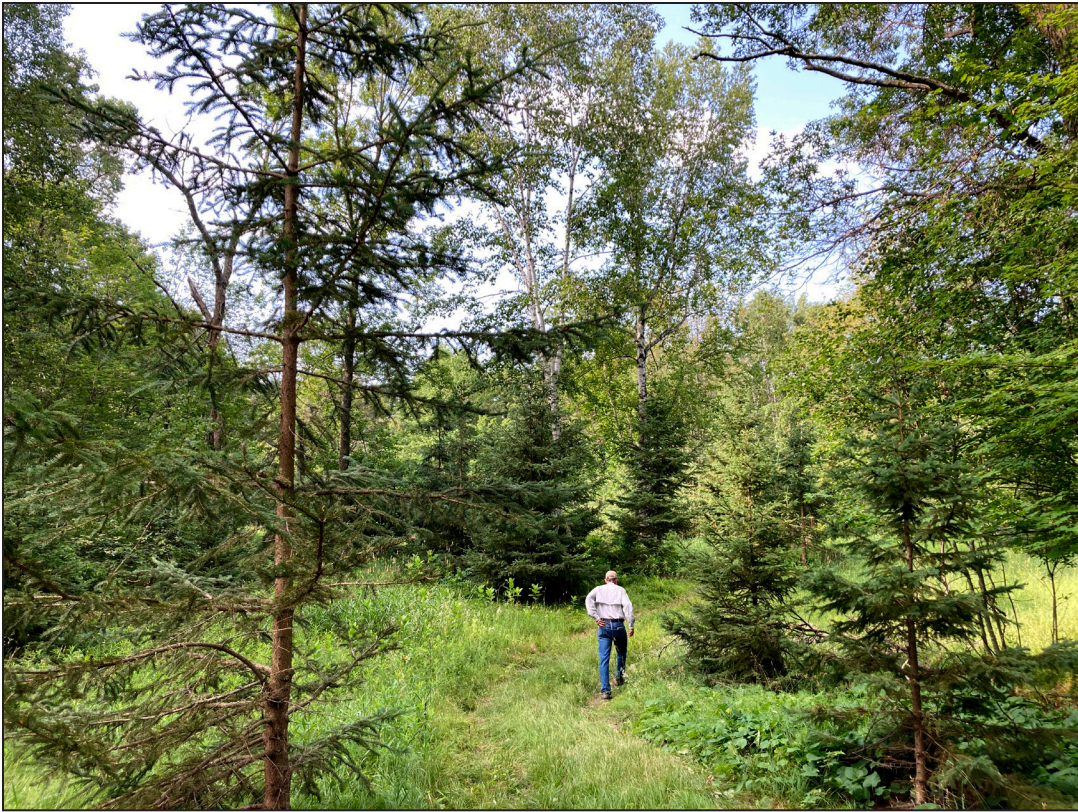
Bob Perleberg walked down one of the trails that provides access to 480 acres of managed forestland punctuated by wildlife food plots and ponds. The Perlebergs have planted and harvested trees in an effort to maintain a thinned stand of multi-aged mixed hardwoods. Because their land lies within the Sentinel Landscape, which extends 10 miles from Camp Ripley, NRCS assistance was available to offset the cost of some management practices.

and resource concerns, and then pursue NRCS assistance to implement practices.