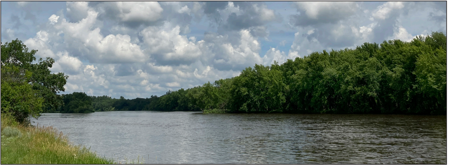
Camp Ripley is 18 miles long and 8 miles wide, with 18 miles of undeveloped, undisturbed Mississippi River flowing through it. About 30,000 military personnel and civilians train at Camp Ripley every year.

Conservation District has worked with landowners to enroll 329 permanent easements totaling 33,126 acres within the tighter, 5-mile Army Compatible Use Buffer. Those working-lands easements restrict development and help wildlife — giving animals such as gray wolves and white-tailed deer enough room to roam, retaining niche habitats for species such as the federally threatened Northern long-eared bat.