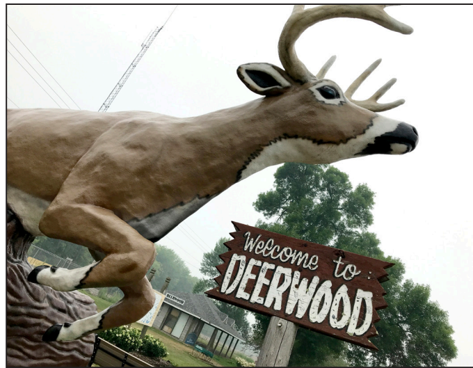
Above: Deerwood's economy depends heavily upon tourism. Below: An angler was obscured by smoke from distant wildfires on July 20, 2021.

“ We didn't have a budget to take on ... a project like this ourselves. The grant opportunity was extremely helpful. We'd have never been able to do it, plus we don't have the expertise on our staff to take on a project like that. ”