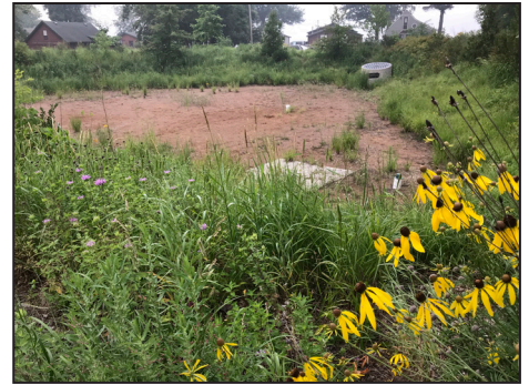
Above: A two-stage retention basin and iron-enhanced sand filter slow and treat runoff from a 30-acre drainage area in Deerwood, removing about 90% of the phosphorus. At the Summer Place on Serpent Lake, heavy rains had flooded some — but not all — of the 13 cabins. Getting all 13 to agree to the project generated conflict and negotiation because those unaffected by flooding didn't want to give up land. Below: From left: Barrick, Michels, Tichenor and Chamberlin discuss the targeted watershed project at the new outlet to the lake.

keep an estimated 80 pounds of phosphorus out of Serpent Lake annually.