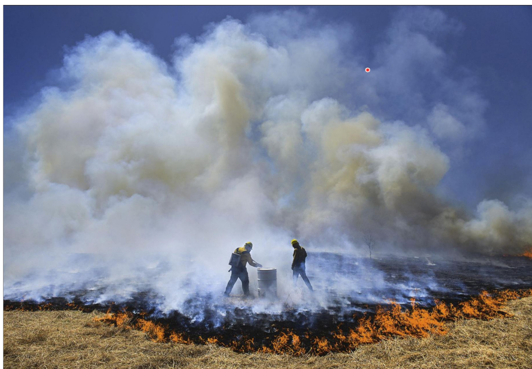
Bottom: St. Cloud Times photographer and videographer Dave Schwarz used a pointer tool (red dot) while discussing a photo of a controlled burn to illustrate photo composition during his Oct. 27 session "Photography in the Field."

out prior with materials and tasks in order to prepare," said Nicole Bernd, West Polk SWCD manager, who attended BWSR Academy. "WebEx hosts and presenters navigated fluidly through the platform and were well-