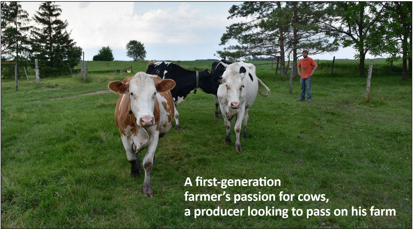
A first-generation farmer's passion for cows, a producer looking to pass on his farm