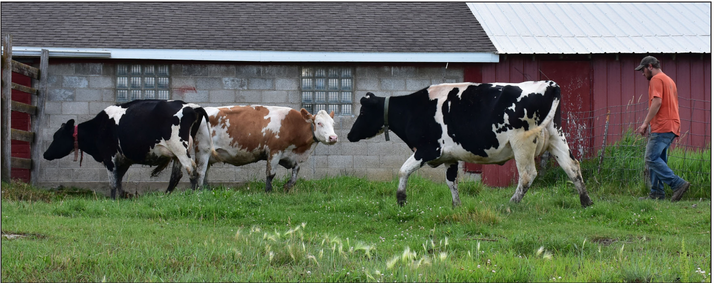
Jack Schouweiler and Ben Wagner will move the milking operation to a remodeled barn on the farm Schouweiler bought from Wagner's retired brother. That new parlor setup — with a new manure storage system at that site and an expansion of rotationally grazed pasture, both made possible with NRCS assistance — will protect groundwater and surface water within the Upper Chippewa River watershed. Those improvements also will make it possible to eventually expand from 38 to 70 cows. The cattle usually stay clean in the pasture but recent heavy rains made spots muddy on July 8.