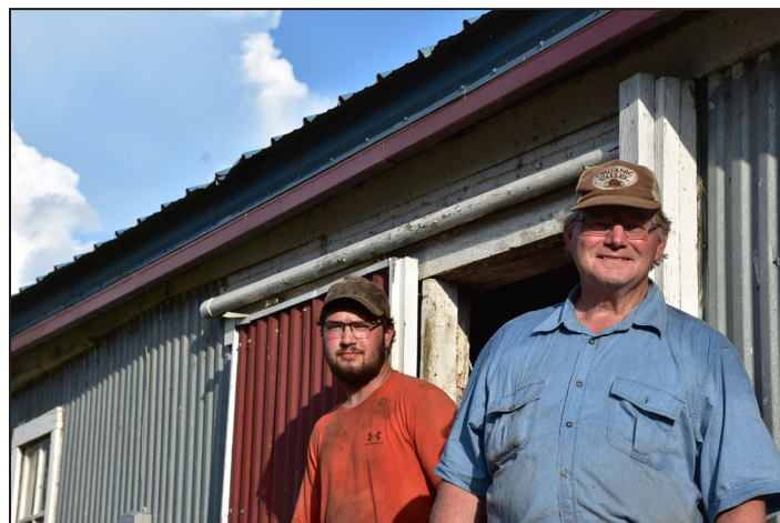
Pasture expansion, new manure storage system made possible by Clean Water Funds, NRCS assistance and help from Douglas SWCD staff will improve water quality in the Upper Chippewa River watershed as it sets beginning, retiring farmers up for the future

A remodeled parlor style barn, new manure storage facility and 59 acres of additional pasture for rotational grazing will make chores less back-breaking, allow the dairy to expand — and protect both groundwater and surface water in the Upper Chippewa River watershed.