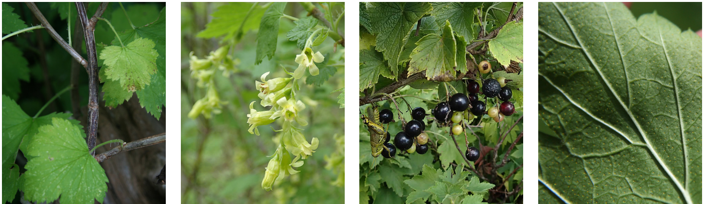
From left: Wild black currants' stems are reddish-brown and smooth with light ridges or wings. Courtesy Photo Currant flowers are a high-priority food source for the endangered rusty patched bumblebee. This is wild black currant, Ribes americanum . Photo Credit: Peter Dzuik, Minnesota Wildflowers Mature fruits are blue-black by late summer. Photo Credit: Peter Dzuik, Minnesota Wildflowers Yellow resin glands dot new stems and both leaf surfaces. Glands are usually more numerous on the lower surface of leaf blades. Courtesy Photo

Plant family: Gooseberry ( Grossulariaceae )