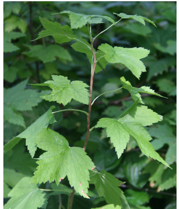
Leaves are alternate with three to five palmate lobes. Leaf margins are sharply toothed.

Many of the disease-resistant currants available at nurseries are cultivars of European black currants ( Ribes nigrum ) and red currants ( Ribes rubrum ). Native currants are preferred for greater pollinator benefit, but they are uncommon commercially. See the Minnesota Department of Natural Resources' list of native plant suppliers .