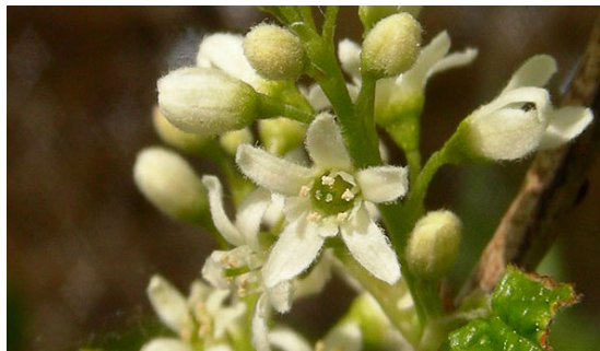
Flower clusters of northern black currants are upright.

Northern black currants, Ribes hudsonianum , are found primarily in conifer swamps in the northern third of the state. Like wild black currants, they have smooth stems and leaves with yellow resin glands,