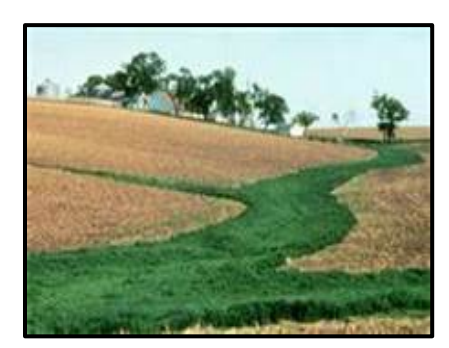
Grassed Waterway (Std. 412)