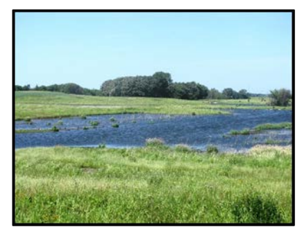
Wetland Restoration (Std. 657) or Impoundment