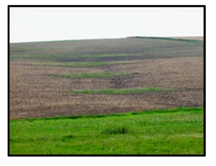
Water & Sediment Control Basin (Std. 638)