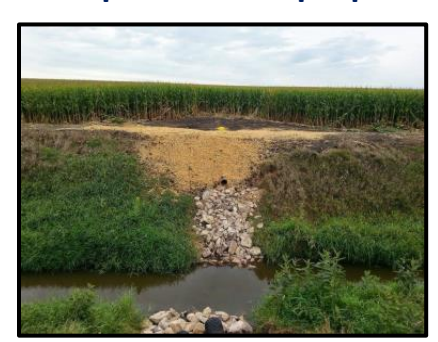
Side Inlet to a Ditch (NRCS FOTG Std. 410)