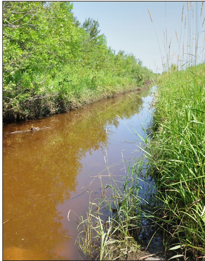
A previously straightened stretch of the West Branch Warroad River flowed down a township road ditch. The gravel road was prone to erosion.

downstream sediment deposition benefits the entire Warroad River system.