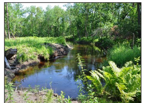
Left: A Warroad River Watershed District project that returned a stretch of the West Branch Warroad River to its natural, sinuous streambank was nearly complete in late July. Center: The structure held up to severe flooding in September. Some spots that eroded at the field's edge, seen here in July, will be fortified. Right: Returning a segment of the West Branch Warroad River to its natural channel more than doubled its length to about 10,750 feet. The natural twists and turns cut velocity and reduce erosion.