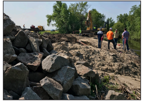
A crew from Gerit Hanson Contracting drove sheet piling into the ground in late July along the West Branch Warroad River in Roseau County. They built a 50-foot-long water control structure as part of a Warroad River Watershed District project funded by a Disaster Relief Assistance Program grant from the Minnesota Board of Water and Soil Resources. Contractors would later place rocks to help to armor the structure.

“ It’s nice to see this district take this project on. Hopefully it ignites in them the desire to do more projects like this. ”