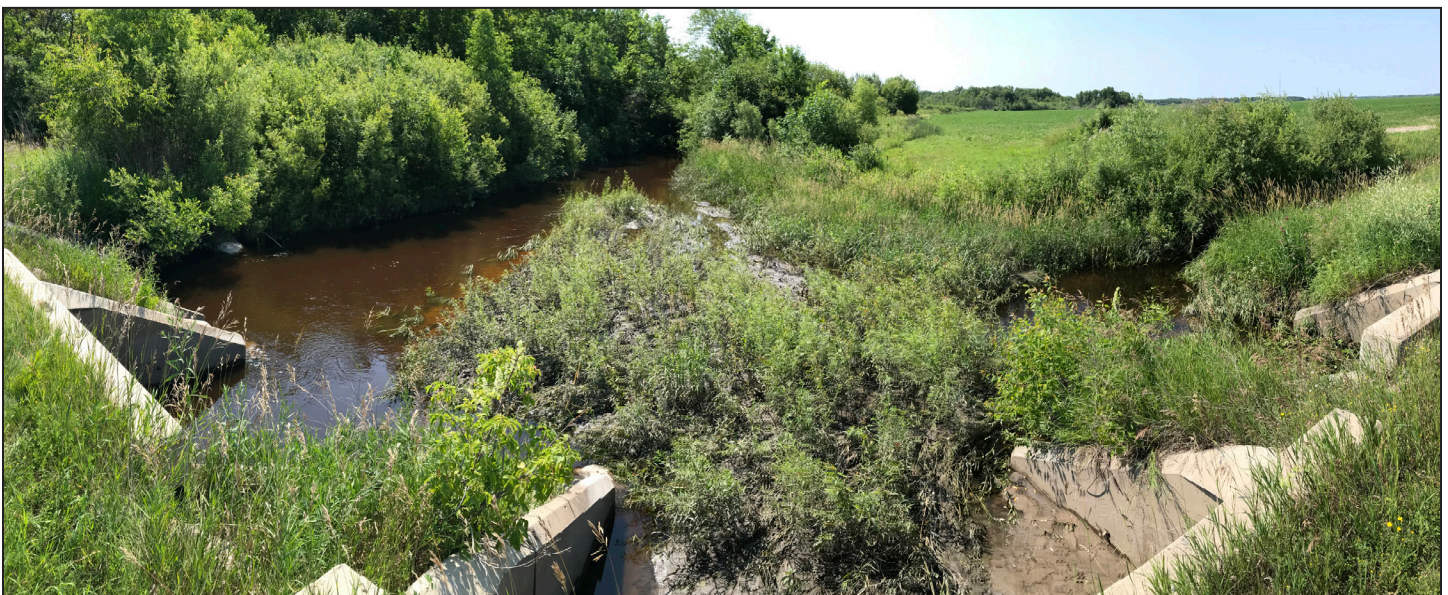
Not far from the Warroad River Watershed District project, sediment deposition was evident in culverts through which the West Branch Warroad River flowed.

The Minnesota Board of Water and Soil Resources’ mission is to improve and protect Minnesota’s water and soil resources by working in partnership with local organizations and private landowners. www.bwsr.state.mn.us .