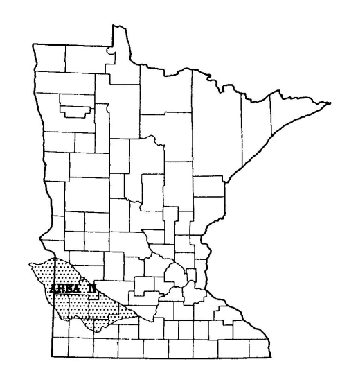
Member Counties Brown ● Cottonwood ● Lac qui Parle Lincoln ● Lyon ● Murray ● Pipestone Redwood ● Yellow Medicine