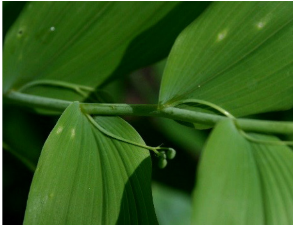
Flower buds grow from the leaf axils in early spring.

Solomon's seal grows best in loamy soils with light shade and moderate moisture. It will spread to form patches. White-tailed deer may browse the plant heavily, so it may not thrive where large deer populations exist. Seeds, plants and bare-root stock are available from many nurseries. To ensure the plant is adapted to local conditions and was propagated rather than