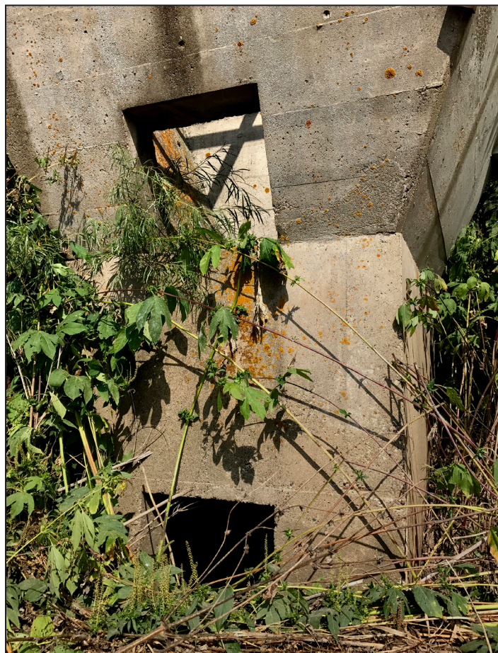
After 60 years, sediment was flush with the lower inlet. In recent years, the 3-acre settling pond was farmed.