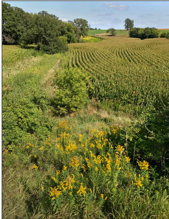
Top: The downstream view from the 494-foot-long, 24-foot tall earthen dam shows corn fields. Contour strip cropping was among the conservation practices put in place when the dam was built. Bottom: The Root River flows outside Preston.

The pond once attracted ducks, geese and waterfowl hunters. Once it filled in, his father farmed the land. At times, it produced good corn crops. At times, the