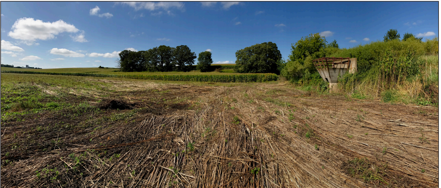
The East Willow Creek Flood Control Project, built to protect Preston from flooding and to trap sediment from the 2,000-acre watershed, became operational in 1955. A Clean Water Fund grant covered the cost to excavate sediment from the 3-acre settling pond. The structure never lost its flood control function. In early September, corn grew around the filled-in settling pond where the landowner had flattened ragweed to prepare for work.