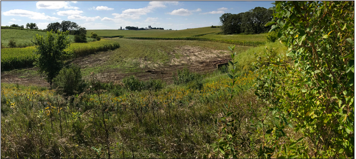
Tree and brush removal was the only maintenance required on the dam itself. When it was built in the 1950s, the East Willow Creek Flood Control Project was considered among the most successful of 50 pilot projects across the nation – and the first in Minnesota. The dam and surrounding farm land was seen throughout the U.S. in the form of a 1960s poster and postcards promoting conservation.

not being stored there anymore,” Rasmussen said.