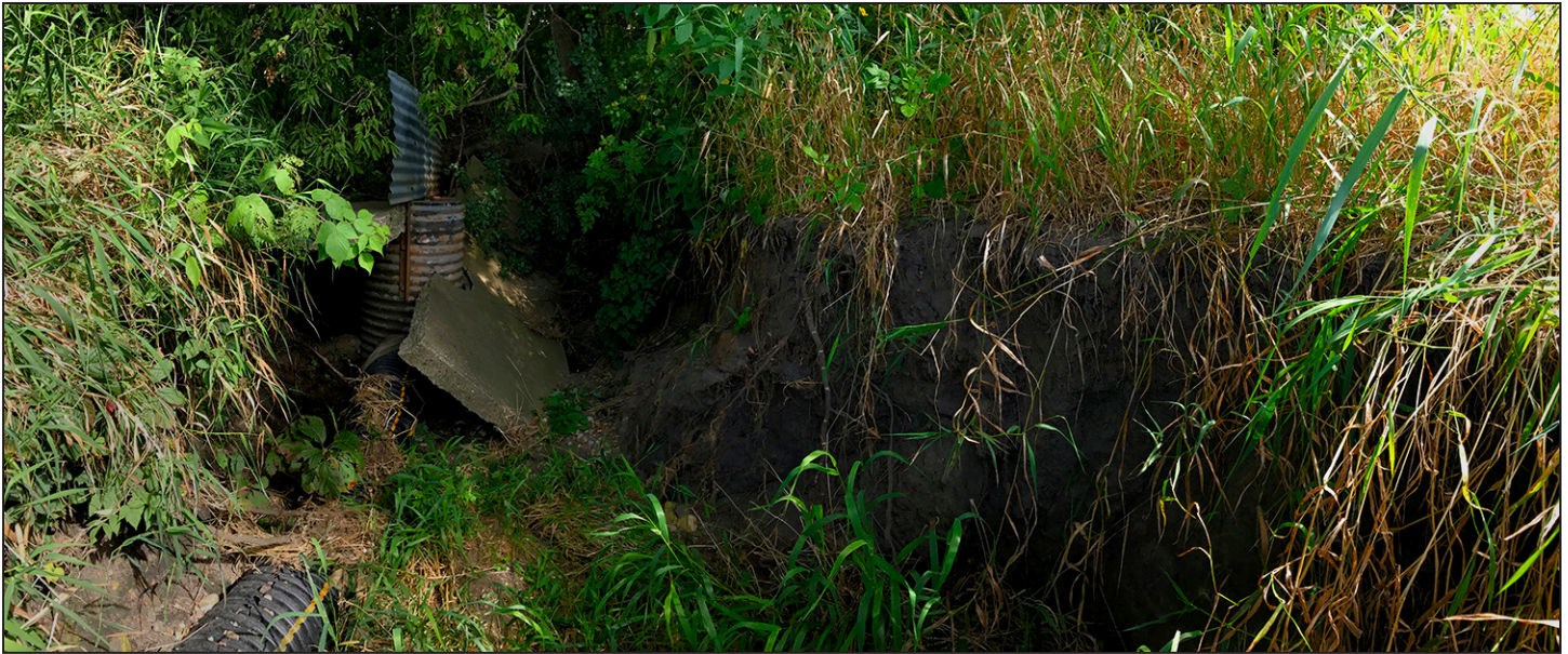
Above: A failing culvert at the edge of Pederson's corn field was on the brink of washing out in September 2017. It was replaced, and the channel was stabilized. The ravine leads to the Cedar River. Below: The view of the culvert from the ravine looking toward the corn field shows the path runoff followed to Cedar Creek south of Austin.

To date, the CRWD has received $3.2 million from the Hormel Foundation, $1.7 million in state bonding and $1.1 million from Minnesota Board