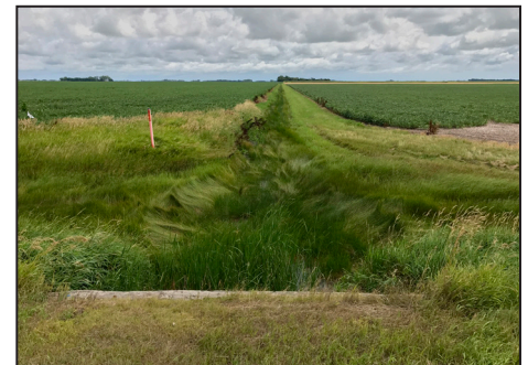
Left: A couple of miles south of the Clay-Wilkin county line in Wolverton Township, narrow buffers are visible in the upstream (east) view of Wolverton Creek. Middle: At a future buffer site, drowned-out crops border the stream channel. Right: Tall grass nearly obscures Wolverton Creek at Wilkin County Rod 3/170th Avenue in Mitchell Township, where the creek cuts a thin line between fields.