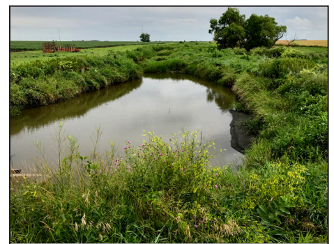
Left: Willow trees frame an upstream, easterly view of Wolverton Creek in Clay County’s Holy Cross Township, about an eighth-mile from the Red River. Along this 2.5-mile stretch, grant funds the Clay County Soil & Water Conservation District received in 2007 were used to remeander the stream.