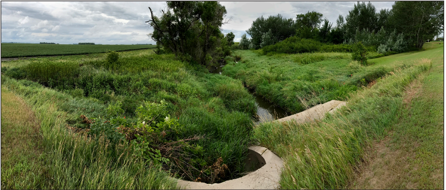
Straight east of Comstock, Wolverton Creek runs under Clay County Road 2 in Holy Cross Township. This is the downstream (north) view.

A third, $2 million phase would augment previous work – adding side-inlet culverts and buffers, clearing downed trees – starting at the outlet where Wolverton Creek cuts to the level of the Red River.