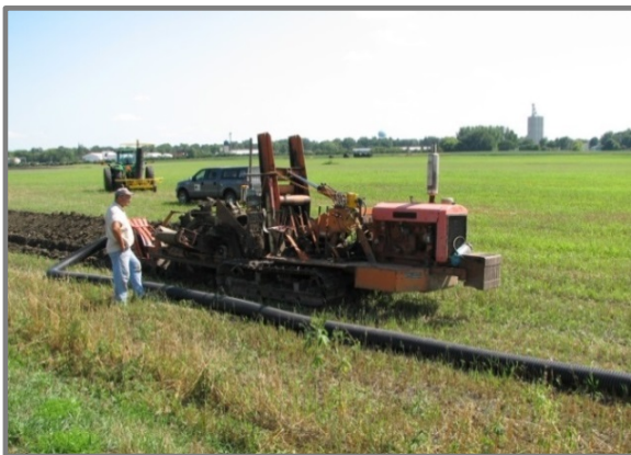
Figure 1. Rerouting Drain Tile Around a Planned Wetland Restoration

The restoration of wetlands in these types of drainage scenarios provides a number of design and construction challenges and may not always