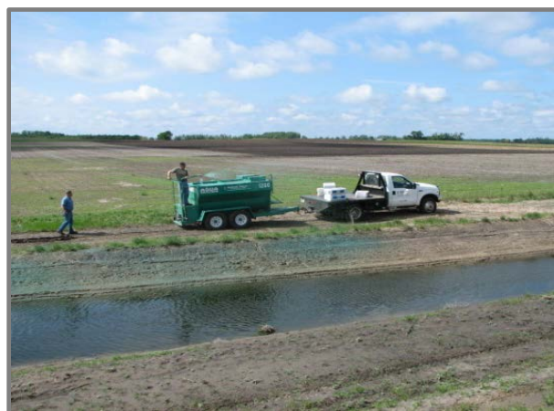
Figure 4. Seeding and Hydro-Mulching a Constructed Ditch Reroute