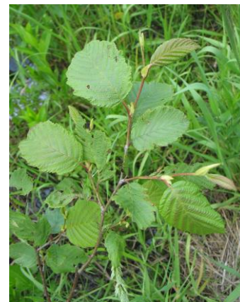
Speckled Alder Seedling

Wetland trees and shrubs are typically planted when wooded swamps and shrub wetlands are a goal for a wetland project, or if woody plants will help meet specific functional goals. Planting trees and shrubs in wetlands is still a relatively new science and more information is needed to improve survival and growth rates. Some estimates show that it may take 35-50 years before restored or created forested wetland sites have wetland vegetation and wildlife similar to mature forested wetlands due to plant mortality and slow growth rates of nursery stock (Perry et. al.). The rate of establishment depends on the restoration strategy and size of plant materials used, and the amount of maintenance provided. Planting strategies chosen for a project often depend on the type of community to be restored, project goals, and budget. Equipment needs for projects can include tree planting bars, spades, shovels, augers, tractor pulled planters, containerized trees and shrubs, bare root trees and shrubs, cuttings, tree and shrub seed, tree protectors and watering equipment.