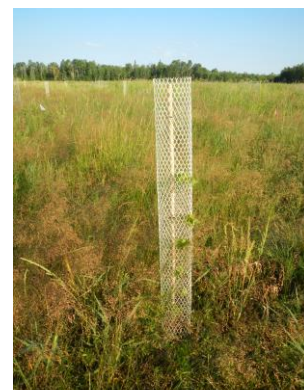
Tree shelter in a wetland restoration

Follow-up watering is important for establishing trees and shrubs. If soils are not saturated, plantings should be receiving approximately one inch per week at a minimum through rainfall or watering.