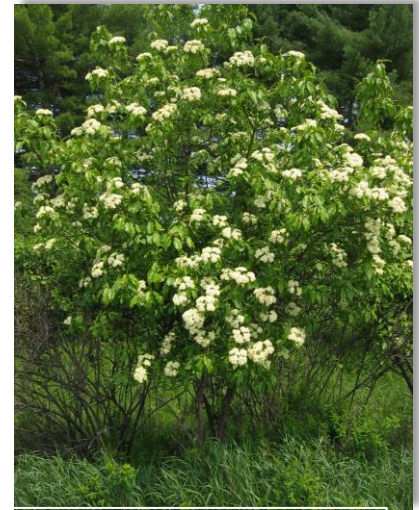
Multi-stemmed growth form

This native shrub can be identified by its pointed buds, unique flowers, and fruit. Growing to around twelve feet tall in open habitats, the species commonly produces suckers and multiple stems. The newest branches are light green in color and glabrous and buds narrow to a point. With age, the branches become grey, scaly and rough. The egg-shaped leaves are simple and opposite with tips abruptly tapering to a sharp point. Leaf surfaces are shiny, dark green and hairless with reddish finely serrated margins. Fall color is a vibrant dark red. Numerous dense, flat-topped flower heads appear and bloom from May to June. Flowers are creamy white and bell to saucer-shaped. The flowers develop into elliptical berry-like drupes that turn a blue-black color from July to August. The sweet and edible fruit is used by a variety of wildlife species but has a wet wool odor when decomposing, thus its alternate name – Sheepberry.