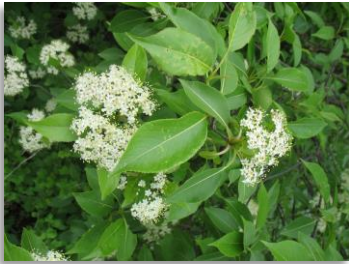
Flat-topped flower clusters and finely serrated leaves

Statewide Wetland Indicator Status: Great Plains – FACU Midwest – FAC N. Cent. N. East – FAC