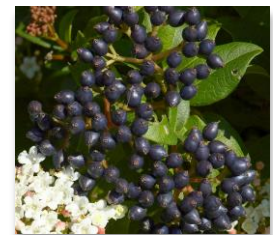
Berry-like drupes of Nannyberry

Viburnum lentago is common through most of Minnesota and is winter-hardy to Zone 4. Outside of Minnesota it can be found in the Northeast from New Brunswick and Quebec, Canada to Colorado and Virginia in the United States. Its natural habitat includes rocky, mesic, and low woodlands along streams or swamp borders, thickets, roadsides and fence rows.