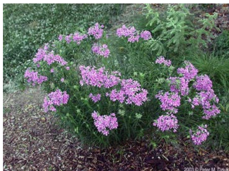
Prairie phlox is a popular garden plant.