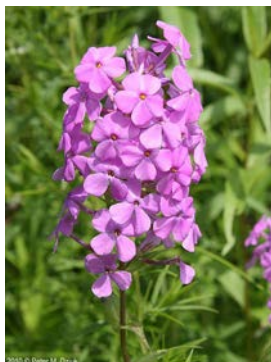
Wild Sweet William

Photo Credit: Peter M. Dziuk, Minnesota Wildflowers