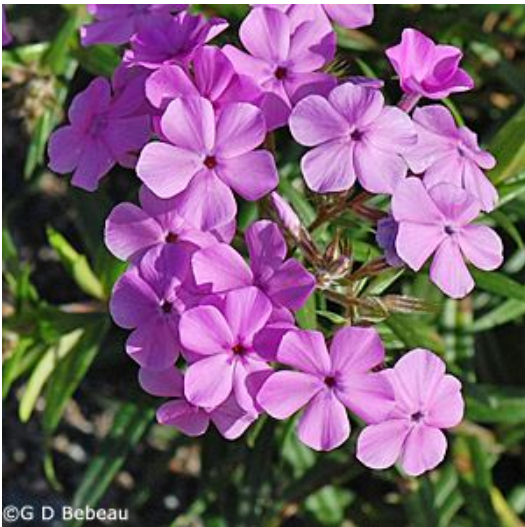
Prairie phlox flowers typically range from pink to lavender.

A showy perennial, prairie phlox blooms from May to July in Minnesota. Pollinators use its flat, flared petals as a landing site. It attracts a variety of butterflies, moths and native bees. Several mammals graze on it. The many varieties of phlox are distinguished by the hair, or lack thereof, on the sepals (calyx) of the plant. The calyx of prairie phlox, AKA downy phlox, is purple to green and hairy. While sometimes difficult to grow from seed, it is an attractive, fragrant and beneficial native addition to pollinator gardens, rain gardens and conservation plantings.