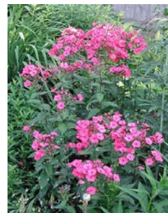
Garden phlox

Dame's rocket ( Hesperis matronalis ) is in the mustard family, identified by its four rounded petals and alternate leaves. Dame's rocket is invasive and common in disturbed soils.