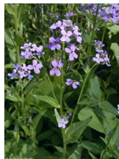
Dame's rocket