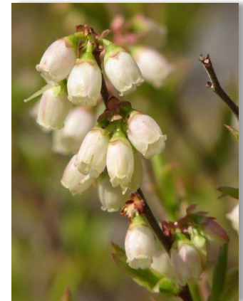
Bell shaped, white flowers