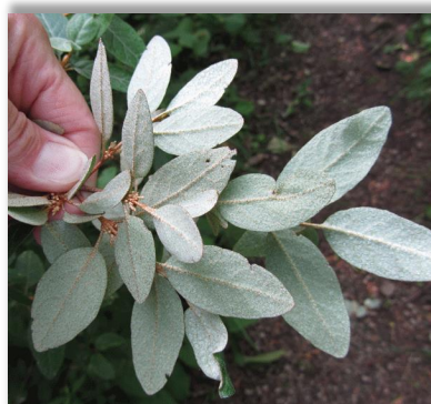
Hairs on the underside of the leaf on Velvet-leaf blueberry

Nearly identical in growth form and habitat, the Velvet-leaf blueberry ( Vaccinium myrtilloides ) is easily mistaken for the Lowbush blueberry, (and vice versa). However, as the name suggests, the two species differ in the leaf textures. The Velvet-leaf blueberry leaves are soft, hairy and lacks leaf margin serrations. The Lowbush blueberry on the other hand has mostly hairless leaves.