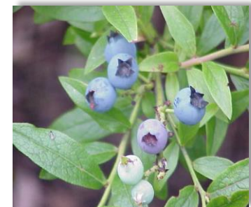
Powdery blue berries ripen in July and August

Growing to around two feet high, Vaccinium augustifolium is a small understory shrub with multiple branches spreading in angular forms. Young twigs are light green but become scaly grey-brown as they age. Older braches eventually die off after a few years and are replaced by younger branches. The leaves are simple and alternate, mostly stalkless and elliptic in shape. They are medium green, hairless and glossy with very finely serrated margins. The undersides of the foliage are only slightly paler than the top. Bell-like flowers develop over approximately three weeks (between May to June) on the preceding year's twigs, producing ¼ inch to ½ inch diameter fruits from July to early August. The powdery blue berries typically contain ten to twelve seeds which are spread by many waterfowl, songbirds and mammals.