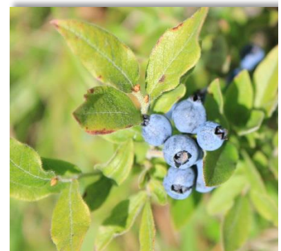
The upper leaf surface of Velvet-leaf blueberry