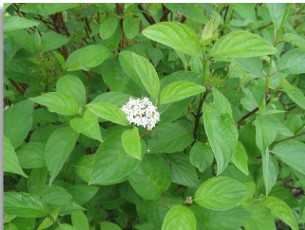
Red-osier dogwood (Cornus sericea) grows in similar locations as buttonbush but has alternate leaves, flat clustered flowers and reddish stems.