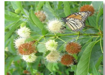
Round clusters of flowers are attractive to Monarch butterflies in mid-summer

Round clusters of one-inch wide flowers with a "starburst" appearance make Buttonbush unique amongst Minnesota shrubs. Most often found in floodplains and other moist habitats with partial shade, the species is useful for storm water projects, shorelines, and buffers in full sun or partial shade. Its height is variable depending on soil and moisture conditions but it can reach up to ten feet tall. It provides excellent pollinator habitat in mid-summer and its seeds are an excellent food source for birds during fall migration.