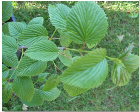
Viburnums such as Arrowwood Viburnum (Viburnum dentatum) have opposite leaves like buttonbush but have teeth on the edges of leaves and flat clusters of white flowers.