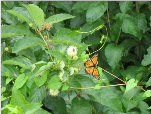
Buttonbush is common in partial shade conditions in floodplain forests

Round clusters of one-inch wide flowers with a "starburst" appearance make Buttonbush unique amongst Minnesota shrubs. Most often found in floodplains and other moist habitats with partial shade, the species is useful for storm water projects, shorelines, and buffers in full sun or partial shade. Its height is variable depending on soil and moisture conditions but it can reach up to ten feet tall. It provides excellent pollinator habitat in mid-summer and its seeds are an excellent food source for birds during fall migration.