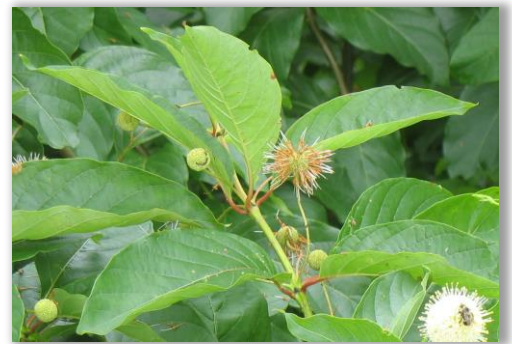
Glossy green leaves that have smooth edges

The species can have a variable growth form depending on growing conditions. In moist soils and full sun it tends to have multiple stems, while in drier soils or shade it may have one or just a few stems. The bark is smooth on young stems but rough and reddish brown on older stems. Its leaves are opposite or are found in groupings of three. The leaves are oval in shape but narrow near the base. They lack teeth and have a glossy dark green surface, with a duller, light green underside. The flowers are arranged in spherical shaped seed heads. Individual flowers are tubular, white, have long styles, and are four-parted.